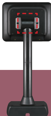
VESA 75 x 75 mm