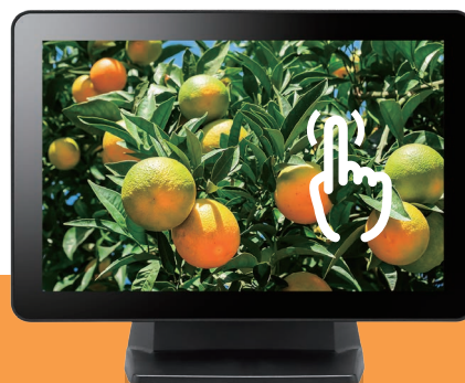
Solid Metal Stand