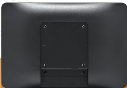
Ultra- Slim with VESA 75 x 75mm Suport

Interface: HDMI or USB or USB-C (Alt mode) Ultra-thin design is better paired with USB-C Capacitive touch as option. Black or white chassis as standard.